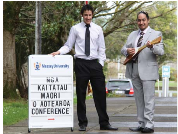
National Māori Accountants Hui 2010

Research themes for Māori educational researchers will include research into Māori medium education, special character education for Māori, engagement of whānau in education, teacher induction and mentoring, and pedagogies relevant to indigenous education.