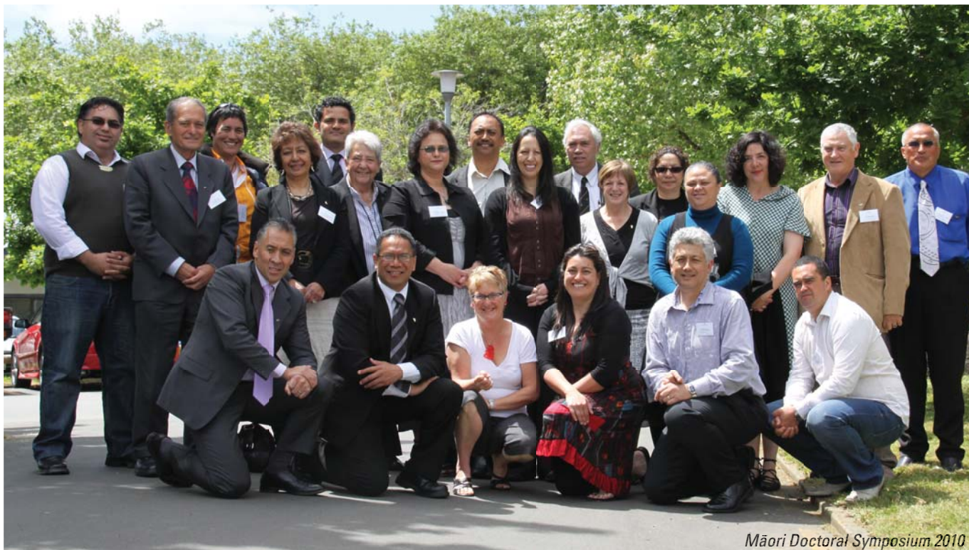
Māori Doctoral Symposium 2010