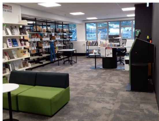
Image: Looking towards the service point in the Wellington interim Library.

The relocation of the Wellington Campus library was completed in early February and the Interim Library, as the temporary space has been named, opened on the 8th of February. The full collection is available for use, although sections of it are stored on a separate floor and available by request only. Shelving is interspersed with study spaces and a sizable computer hub has been constructed at the southern end of the floor. The northern end combines shelving with study tables, comfy chairs, and sofas. While the space offers only two bookable study rooms, the library has been provided with two additional study rooms in Block 7. The library on levels A and B will be closed for approximately 12 months.