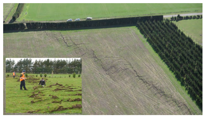
Figure 2: Surface rupture of the Greendale fault, close to Highfield Road, North Canterbury viewed from and the air and ground (inset). At this point there was about 4 m horizontal movement and over 1 m vertical movement on the fault (Main photo: Russel Green, GEER; Insert: University of Canterbury).

the general public were allowed to go from farm to farm (H. Squance personnel communication 2010). The fault rupture also severed buried water pipes for supplying livestock, damaged pumps and affected the ground water table. Whilst there were not significantly hot or dry conditions immediately following the earthquake (such as would be expected in January or February), restoration of livestock water was still a high priority for farmers to ensure animal welfare. Most farms had repaired pipes or shifted livestock to paddocks with reliable water supplies within hours to days of the earthquake.